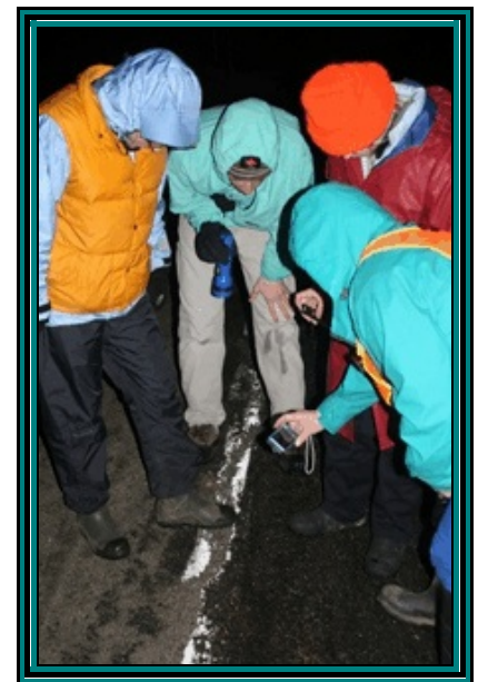
The brigade watches for salamanders during the rainy Big Night.